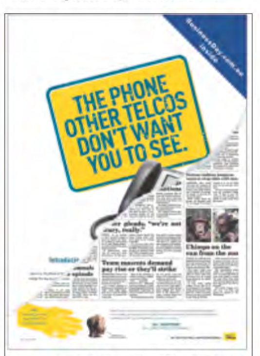
Launch of VoIP to the SMB Market

In 2006 Optus acquired 100 per cent of Virgin Mobile Australia. The company continues to hold a unique position in the mobile market as consumers identify with the passionate and fun approach. Its trendy products and friendly service, coupled with Optus' extensive network, guarantee a fantastic customer experience right across Australia.