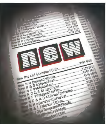
Logos. A new way to stand out.