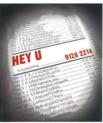
Get noticed with a red listing.